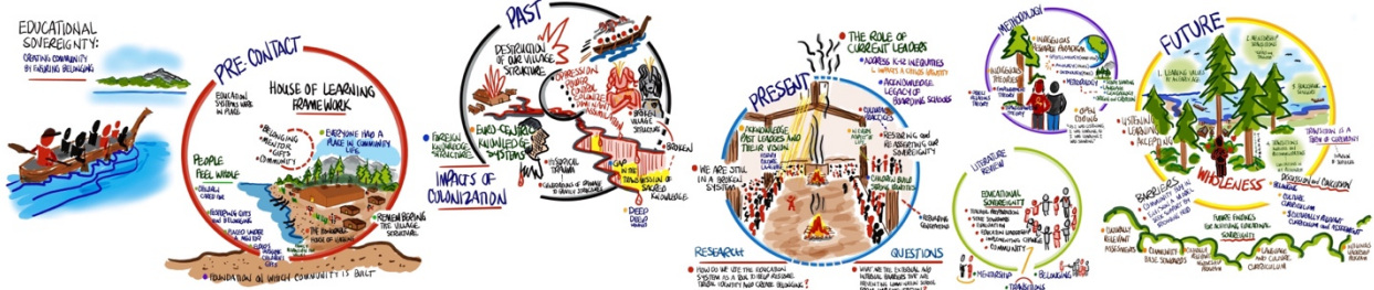
Figure 1: Dissertation Visioning Process. This figure was done by a professional mind mapper Timothy Corey to display my dissertation journey visually.